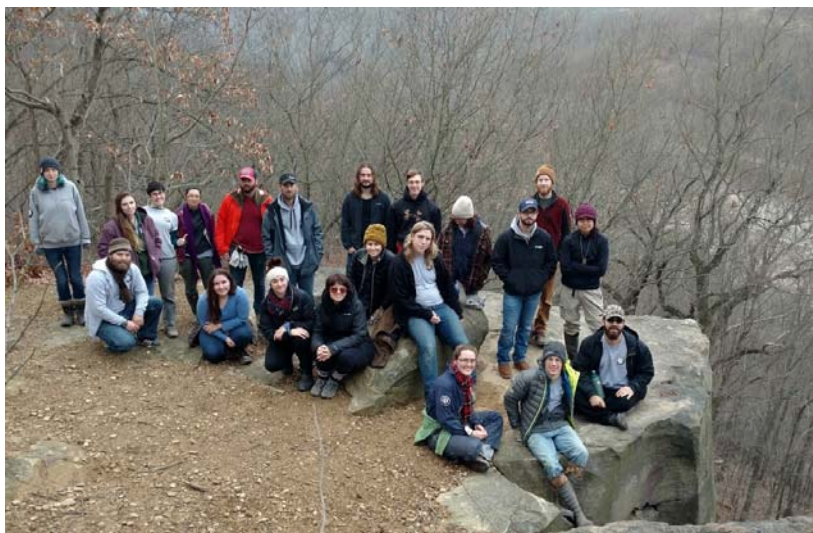
AmeriCorps volunteers from eastern and southeastern Ohio pause for a photo after hiking to Buzzard's Roost in January.