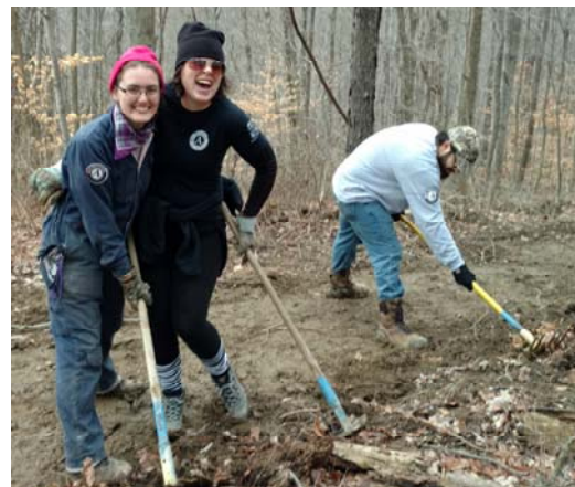
AmeriCorps volunteers laugh while they work on bike trails near the Stone Lodge.