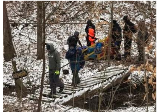
A patrol crosses a bridge with their sled during the 2017 Gold Rush Competition.

Mayors and their assistants for being there to let the patrols of the "Rush" do their thing and show their abilities and knowledge. To all of those who have helped to make Gold Rush such a success, thank you! We will see you next year.